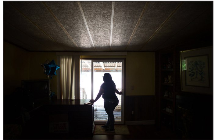
A.B. client pictured at home