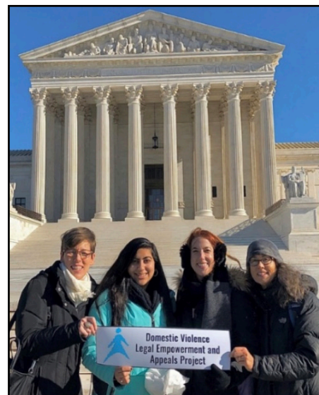
Staff Members of DVLeap in front of the US Supreme Court

The case briefs are recognized by national experts as effective training tools for attorneys representing and protecting battered mothers.